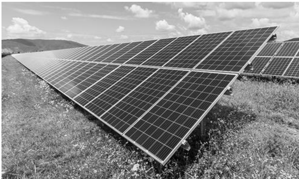
Figure 2. Solar panels for used to generate electricity.

their relevance due to high cost, rather low efficiency (~10%), limited resources (Se, Cd, Pb, etc.). However, the fourth industrial revolution, the widespread use of intelligent systems, an increase in the efficiency of solar cells (~22-30%), the fact that the basic element (silicon) has very large reserves, led to the rapid development of solar energy. Currently, the developed countries of the world are considering the possibility of using solar energy at any time of the year. This type of energy is increasingly used in southern countries. Like other energy sources, panels made from semiconductor polycrystals, monocrystals and thin films occupy a significant area. Recently, these panels are placed on the roofs and balconies of individual houses, but in case of huge energy production, these panels occupy hectares of land. To organize continuous operation of energy panels of this type, it is necessary to ensure that the surface is clean and that the sun's rays fall perpendicular to the surface. Figure 2 shows solar panels.